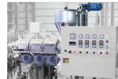
Single Screw Extruder (Sub-extruder) 副料押出機