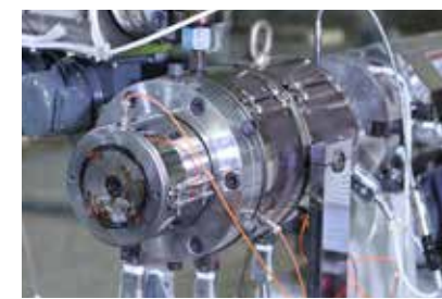
Die Head 押出模頭