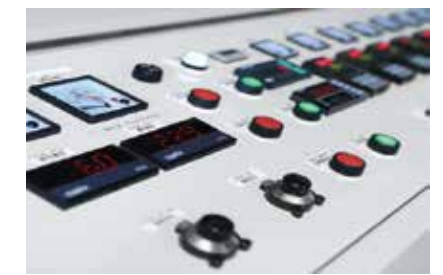
Operation Control System 操作控制系統