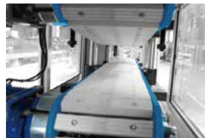
Profile Caterpillar Haul-off 履帶式引取機