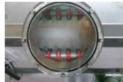
Vacuum Spray Water Cooling Tank 真空噴霧水槽