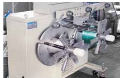
Dual-Axis Cycloidal Winding Machine 雙軸擺線繞線機