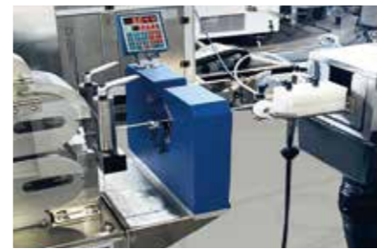
Haul-off Machine 引取機