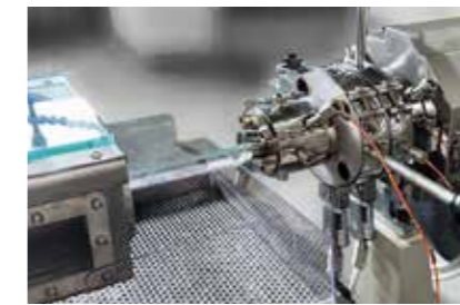
Single Line Die Head 單管押出模頭