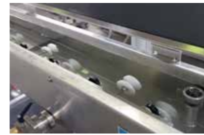
Vacuum Spray Cooling Tank 真空冷卻水槽