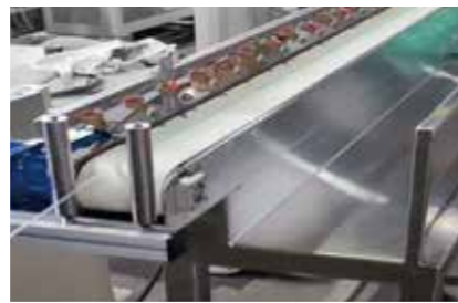
Belt Conveyor 3M air-blowing type conveyor feeding rack, belt conveyor, and high-pressure air-blowing feeding function. 皮帶輸送機 3米氣吹式輸送進料架、皮帶輸送機和高壓氣吹進料功能。