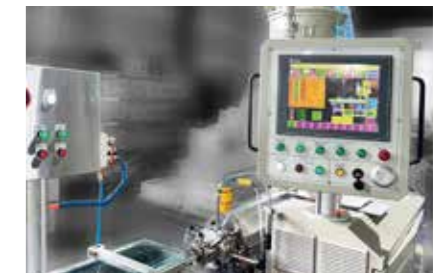
Operation Control System - Tradition operation-control type - PC Base machine operation 操作控制系統 -傳統操作控制類型 -基於PC的機器操作